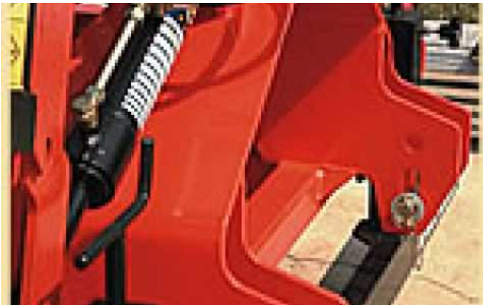
Fork attachment with fixed and slitted pin for 4 - 5 - 6 mt