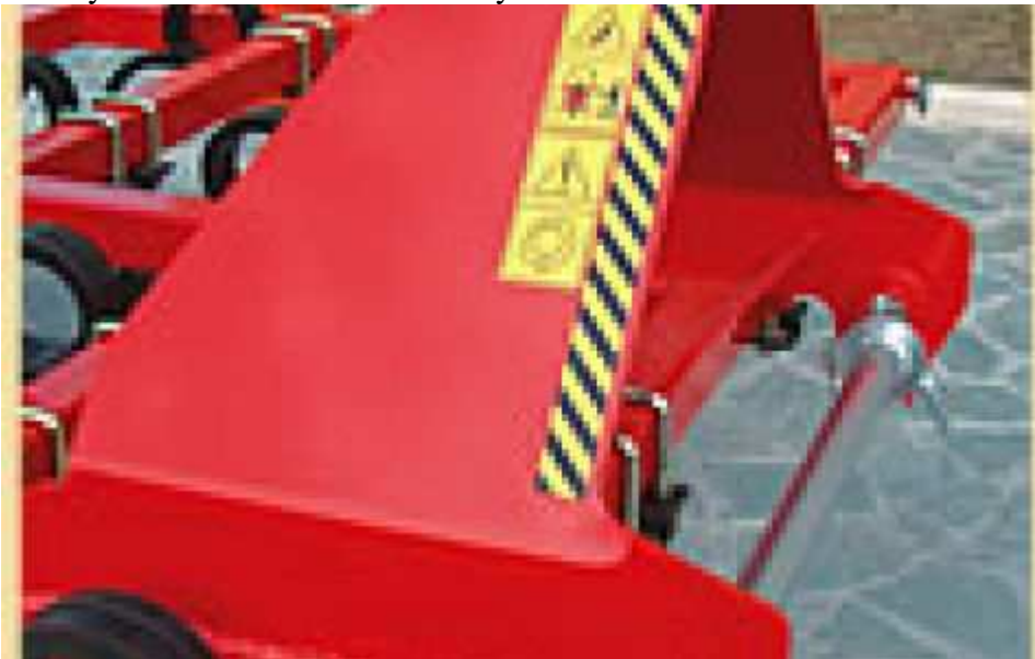
Bar attachment for 2.5 -

with eyelet reinforcement and heavy bracket