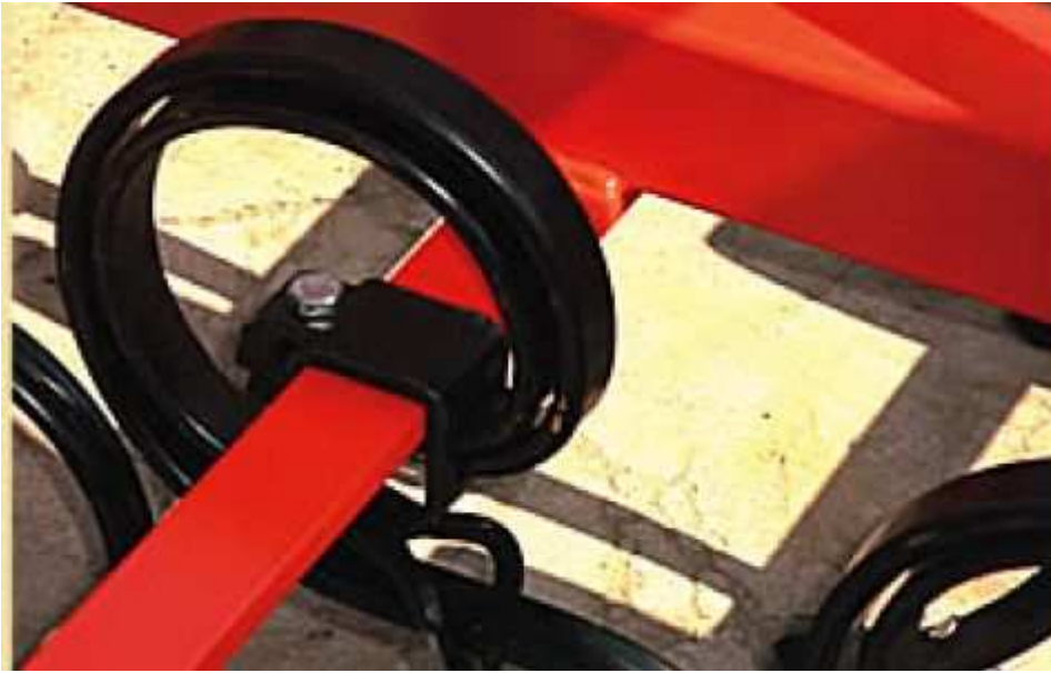
Detail of spring 32x12

with eyelet reinforcement and heavy bracket