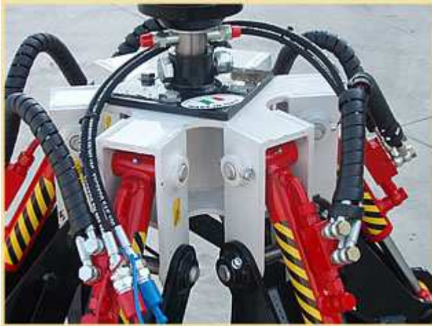
DETAIL OF THE HYDRAULIC CYLINDERS EQUIPPED WITH A BLOCKING VALVE