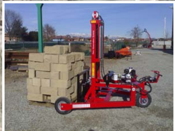
Lift used with forks for transport of pallet.