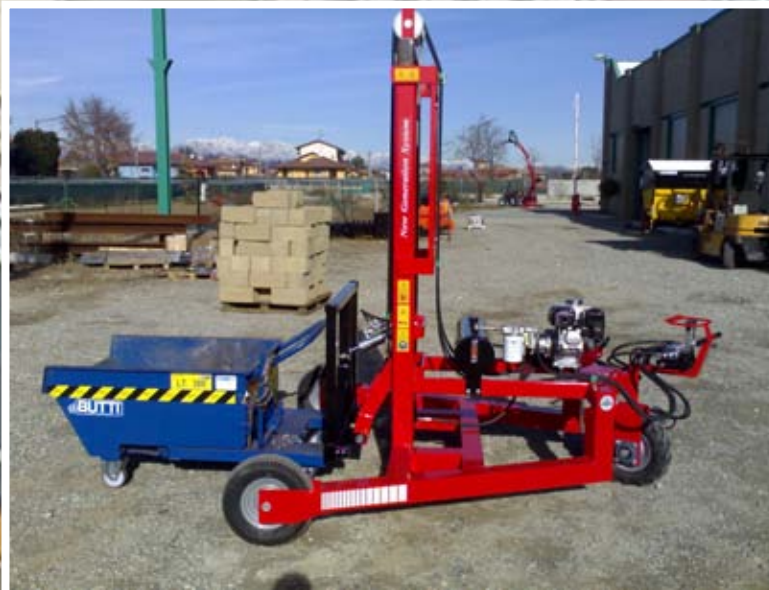
Lift used with hydraulic overturning bucket by auxiliary control lever.