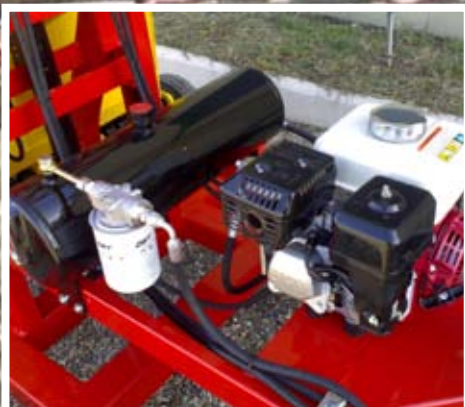
The lift is available with motor feed by petrol or diesel.