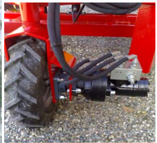
Hydraulic brake applied on driving wheel (as soon as you leave lever the lift stopped).