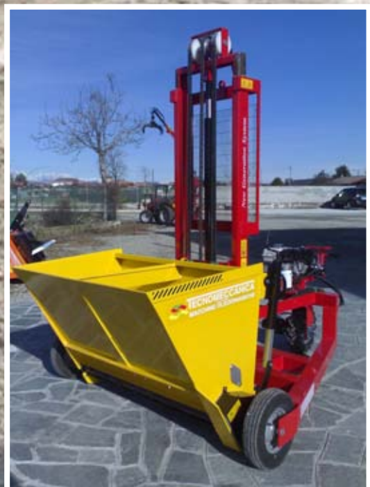
Lift used with sprinkle salt.