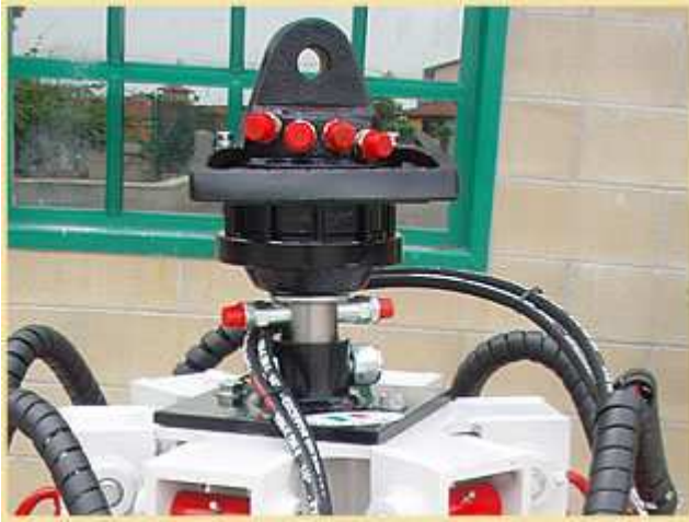
PARTICOLARE ATTACCO ROTORE